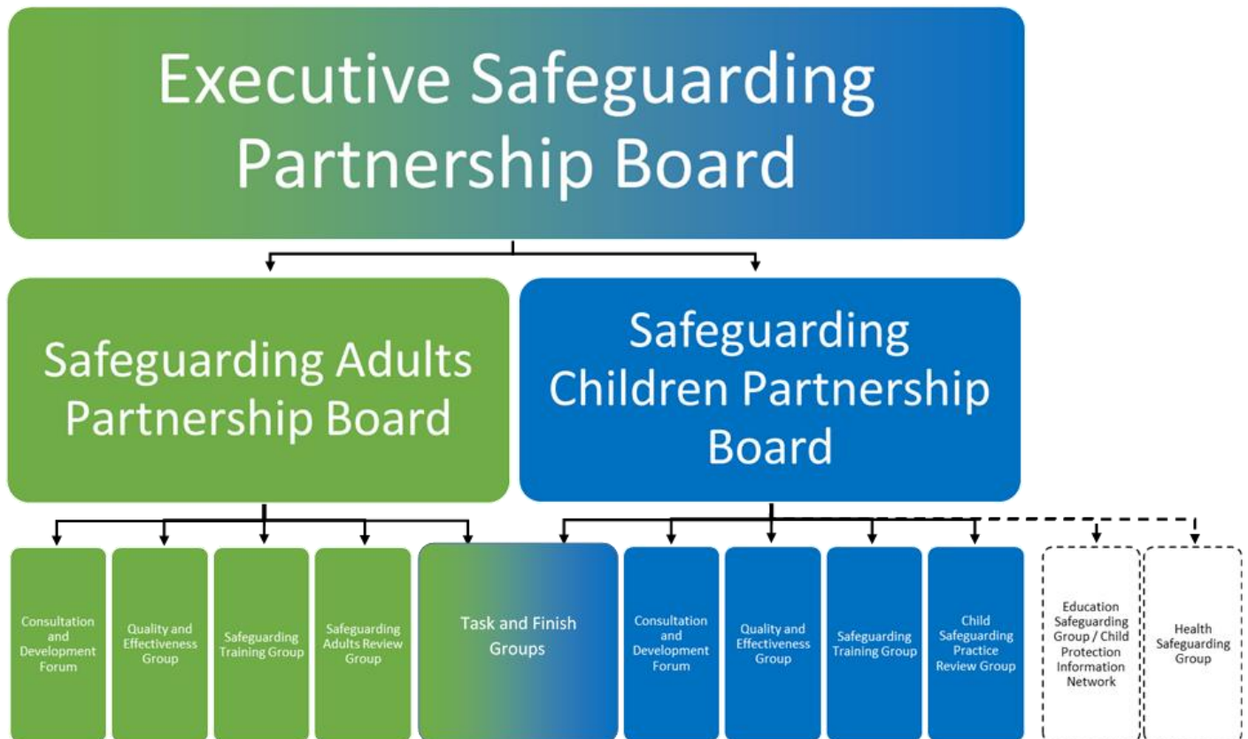
IMAGE 2 - DIAGRAM SHOWING THE STRUCTURE OF THE CAMBRIDGESHIRE AND PETERBOROUGH SAFEGUARDING PARTNERSHIP BOARD

The work of the various Boards and groups within the governance arrangements is overseen by the Independent Safeguarding Partnership Service. The service is managed by the Head of Service and includes roles that cover both adults and children’s agendas. Some of the roles are specialised in quality assurance and improvement, exploitation, training, communication and there are more general adult and children’s leads and dedicated administrative roles. The service ensures that there is robust, countywide independent scrutiny and oversight of multi-agency practice.