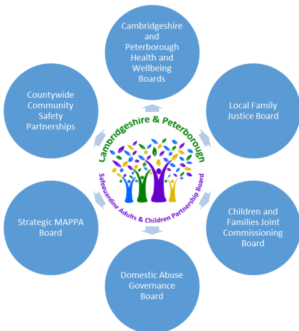
IMAGE 1 - LINKS TO OTHER STATUTORY BOARDS

The Executive Safeguarding Partnership Board has maintained its links with other groups and boards who impact on child and adult services this year. These are illustrated in Figure 1. This ensures that all aspects of safeguarding are taken into account by the other statutory boards and there is a co-ordinated and consistent approach. These links mean that safeguarding vulnerable people remains on the agenda across the statutory and strategic partnership and is a continuing consideration for all members.